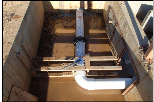
Outlet is Controlled with 8-inch Valve