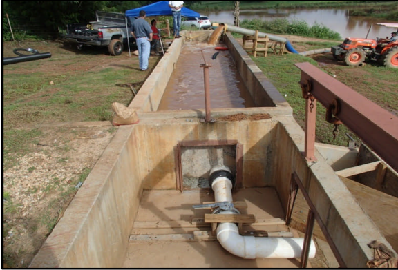
View of Test Pool during Fill Test