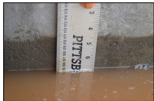
Depth Recorded at Time Intervals During Test