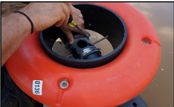
Insertion of Orifice