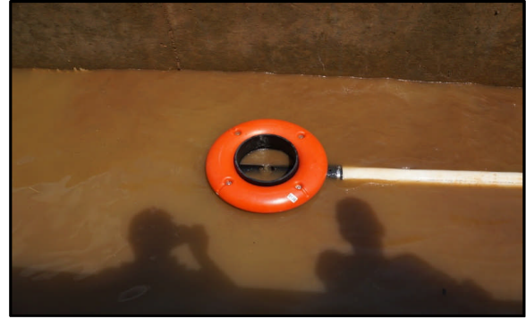
Skimmer Connected to Outlet Pipe