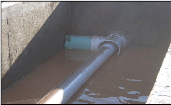
Outlet "Tee" Facilitates Draining Pool