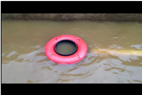
Start of Test