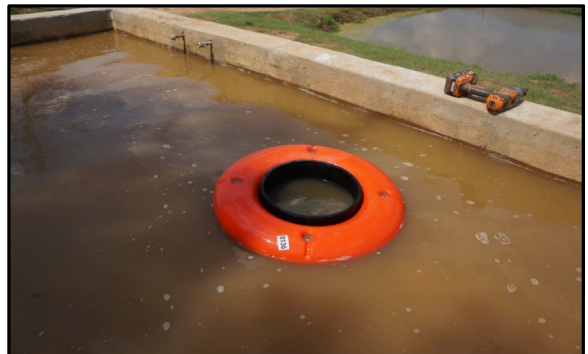
Skimmer Floats to Top during Filling